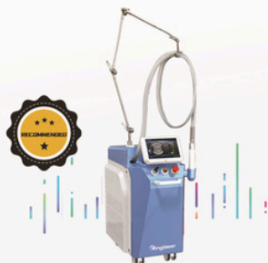
Model KL-D Nd:YAG & Alexandrite Laser