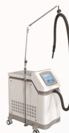
Model KY-15D40 Air Cooling Machine