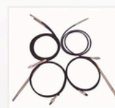
Model ZYS Helium-Neon Laser