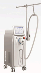
Model KL-E Erbium Fractional Laser