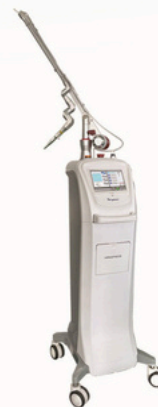
Model KL CO 2 Laser