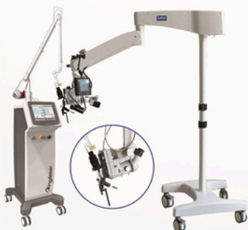
CO 2 Laser Microsurgery System