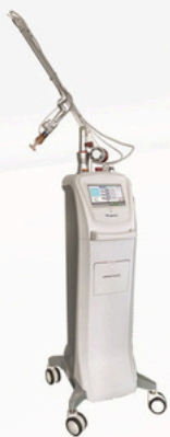
Model KL CO 2 Fractional Laser