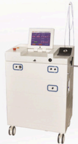
Model KL Nd:YAG Laser