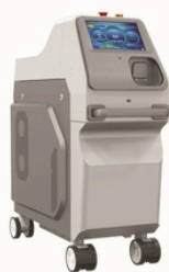
Model KL-Q1 Lithotripsy Laser