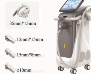
Model KL-L Series of IPL Therapy Instrument