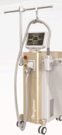
Model KL-300 Diode Laser