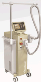
Model KL-600/KL-600C Diode Laser