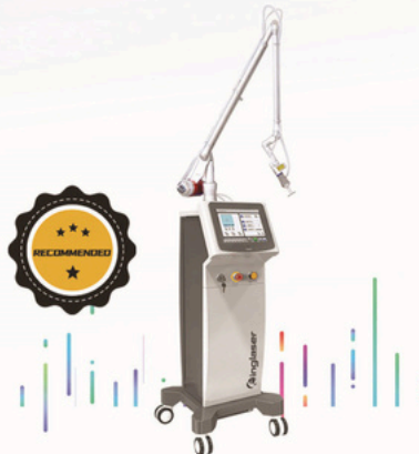
Model KL-R CO 2 Fractional Laser